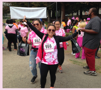
Cooperative Center FCU Faith Walkers 2015 60+ Strong!

Annual Walk Team Drive Friday, July 29<sup>th</sup>, 2016 • 10:00am-4:00pm In Your Credit Union Lobby