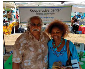
30th Annual Berkeley Juneteenth Celebration | June 2017