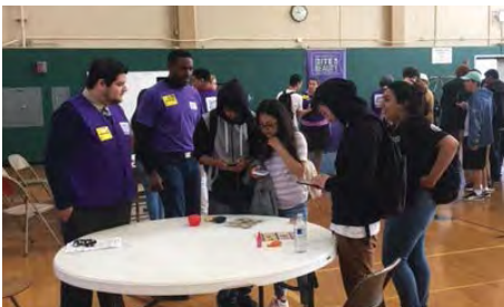
Youth Financial Literacy Day - Bite of Reality May 2017