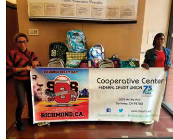
Backpack Drive / Soulful Softball Sunday | August 2017