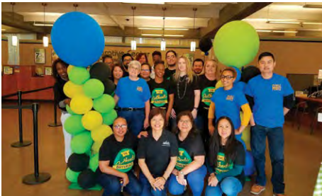
75th Anniversary April 2017