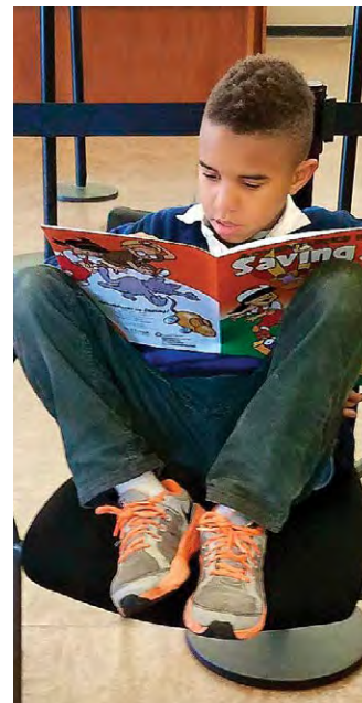
Youth Savings Month April 2017