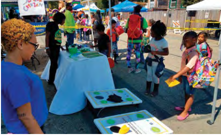
Berkeley National Night Out August 2017

Below are just a few of the ways we've made an impact and served our friends and neighbors over the past year. If you'd like to participate in any of our upcoming scheduled events, simply drop by, give us a call or log on to our website. Be sure to sign up for our quarterly newsletter, which always includes a calendar of events and is a great way to stay on top of all that's going on.