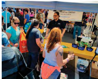
Berkeley Humane Pints for Paws June 2017