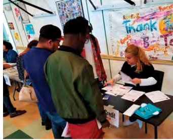
Youth Financial Literacy Day - Mad City Money | April 2017