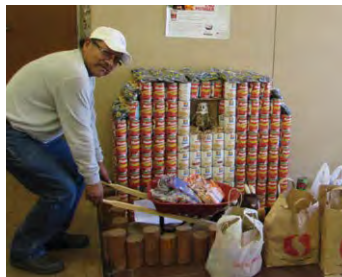
Alameda County Food Bank Annual Food Drive - First Place Award for 560 Pounds of Food August 2016