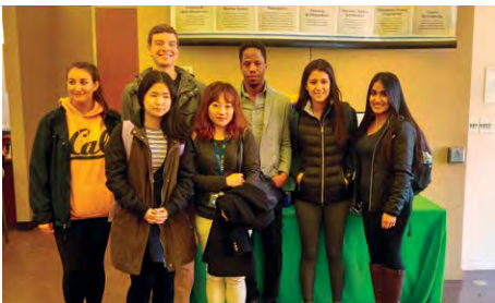
Volunteer Income Tax Assistance (VITA) Earn It! Keep It! Save It! | February - April 2017