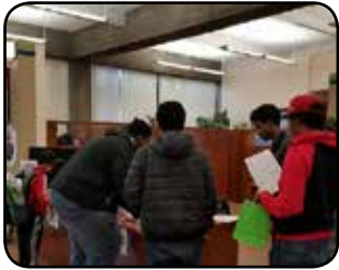
Everyone stopped at the Grocery Store early on, a smart move.

That’s the lesson learned from one teenager who participated in Mad City Money, a simulation for high school students that teaches basic money management in a safe, fun setting.