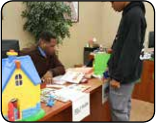
The Really Realtor tries to up sell from condo to mansion.

Face it—a presentation on budgeting likely will put teens to sleep. Yet the 2 ½-hour hands-on simulation appeals to teens and gives them a taste of the real world—complete with occupation, salary, spouse, student loan debt, credit card debt, and medical insurance payments.