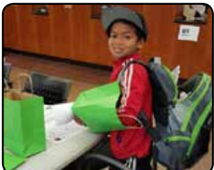
One young participant enjoyed the challenge.

“The best things you can buy are not always the best things you can buy”—words of wisdom from one of the youngest Mad City Money participants in attendance.